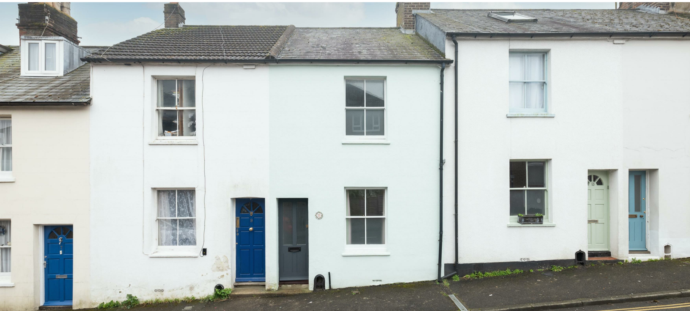
Valence Road, Lewes